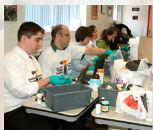
Hospital pharmacists volunteered to identify and collect the medications.

About two years ago, I reached out to hospital officials throughout Suffolk County with the idea of implementing a program to take back unwanted/expired medicines from the community. The intent is to reduce human and environmental risk by protecting the water supply as medications flushed down the drain can seep into our groundwater. St. Catherine of Siena was the first hospital to take back pharmaceuticals as it incorporated a take back program into their annual health fair last fall. I am thrilled that Stony Brook University Medical Center agreed to conduct a similar event at no cost to the taxpayer.