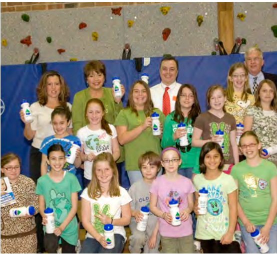
Leg. Kennedy speaks to children at the Pines Elementary School on Earth Day 2009. The students were taught about the environmental benefits of drinking tap water from reusable containers rather than bottled water. Free reusable bottles were distributed to each child courtesy of the Suffolk County Water Authority.

March 2009, saw the much awaited release of the Smithtown Sewering Feasibility Study. Alternative configurations are now actively being reviewed; financing procurement efforts are underway. Revitalization of the Main Street corridor remains a priority.